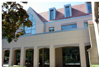
St. Matthew's Hall.