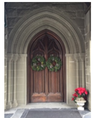
South doors decorated with poinsettias and wreaths of holly and pinecones