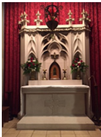
Side altar decorated with holly, roses, mums and fern