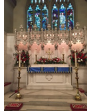
High altar on last Sunday of Advent (Christmas eve morning)