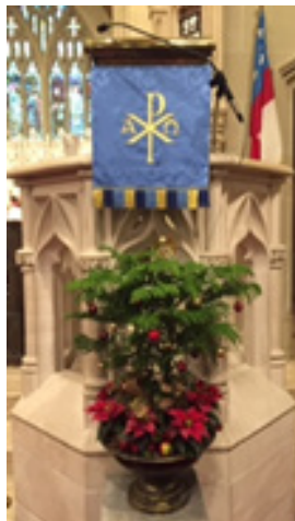
Pulpit on last Sunday of Advent